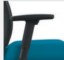
2-D ADJUSTABLE ARM