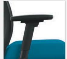
4-D ADJUSTABLE ARM