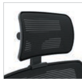
MESH HEADREST Optional headrest available on mid-back mesh task chairs.