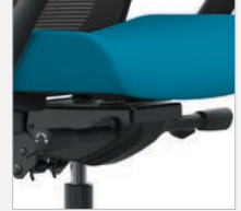
SYNCHRO-TILT W/BACK ANGLE ADJUST