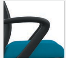
FIXED ARM BLACK